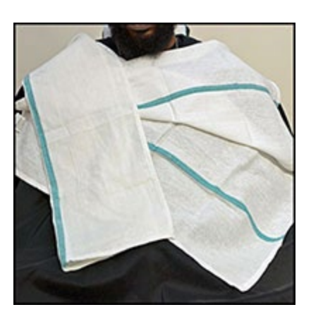
#11-Draping for Shave/Massage (reclined w/headrest cover)