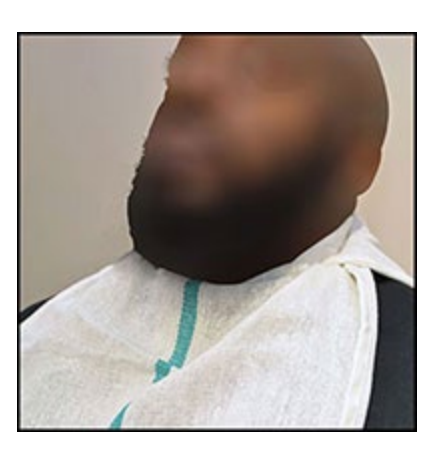
#8-Draping for Shampoo (right side-full view)