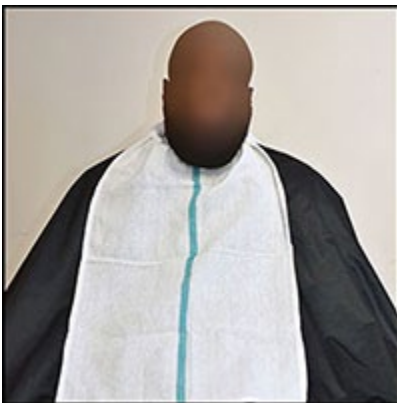
#7-Draping for Shampoo (front-close view)