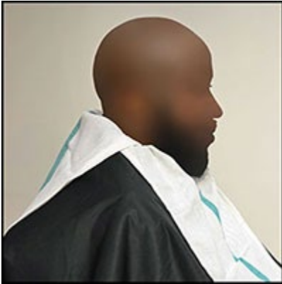
#9-Draping for Shampoo (right side-close view)