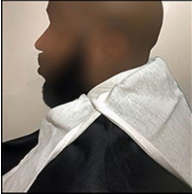
#5-Draping for Shampoo (left side-full view)