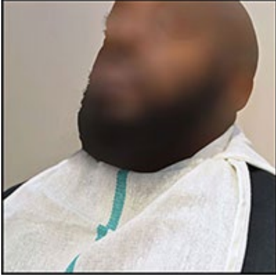
#8-Draping for Shampoo (right side-full view)