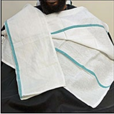
#11-Draping for Shave/Massage (reclined w/headrest cover)