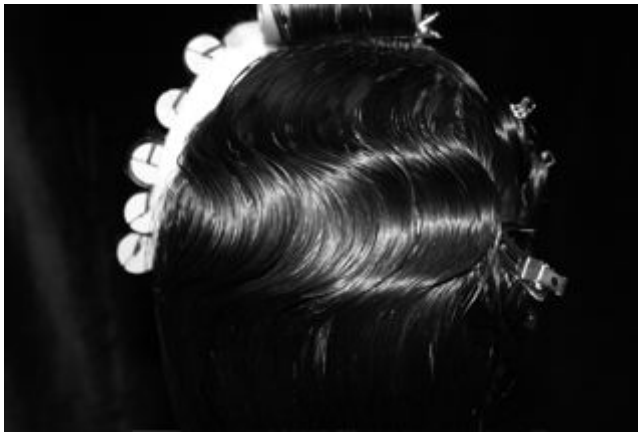
Demonstration of Techniques: Finger Waving (back)