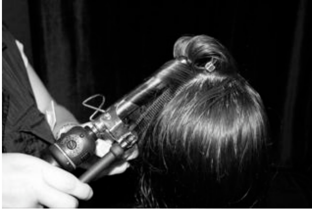
Thermal Curling Iron Techniques: Demonstration of Spiral Curl (side)