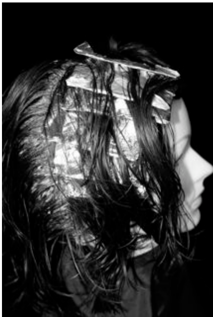
Chemical Services: Foiling Techniques (right front)