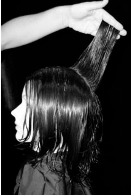
Haircutting Techniques: Ninety-Degree Layered Haircut