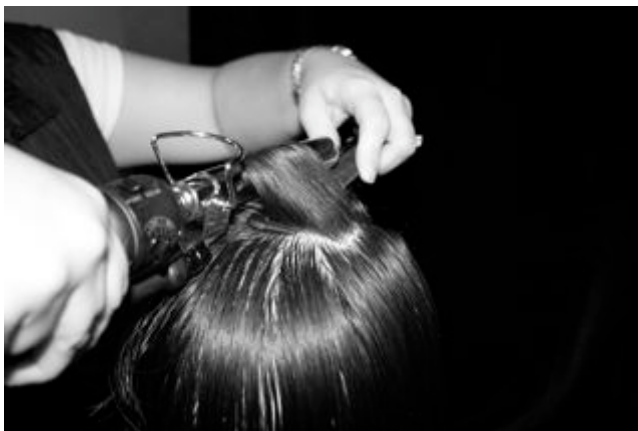
Thermal Curling Iron Techniques: Demonstration of Barrel Curl (top)