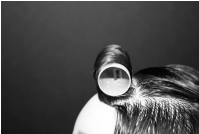
Demonstration of Techniques: First Roller – On Base (top)