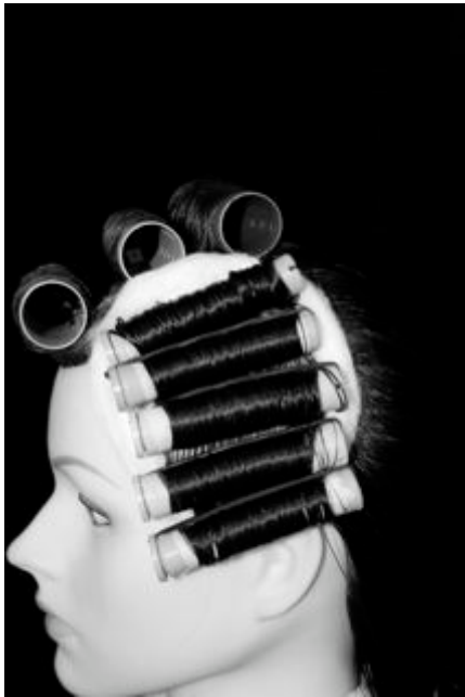
Demonstration of Techniques: Permanent Waving (left side)