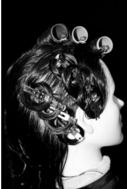
Demonstration of Techniques: Ridge Curl and C-Shaping (right side)