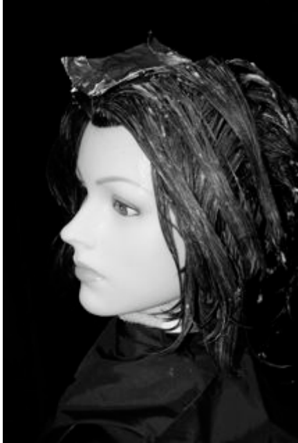
Chemical Services: Virgin Chemical Relaxing (left front)