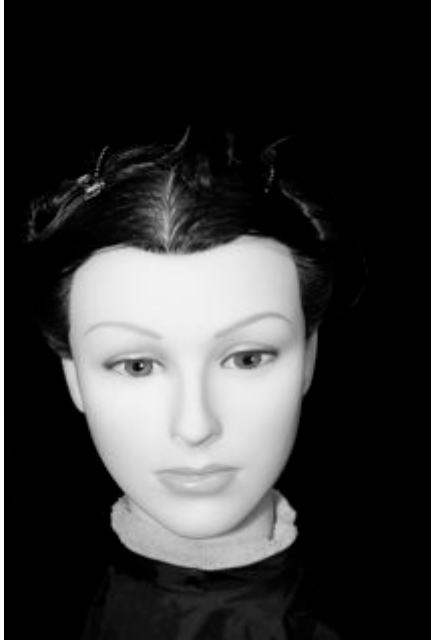
Four-Section Parting for Demonstration of Chemical Services (front view)