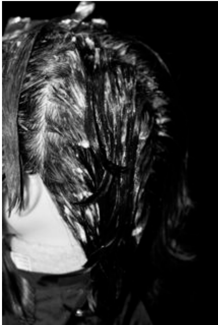
Chemical Services: Retouch Chemical Relaxing (left back)