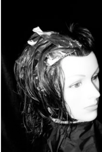
Chemical Services: Foiling Techniques (front view)