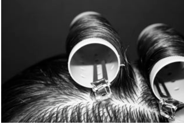
Demonstration of Techniques: Third Roller – Off Base (top)