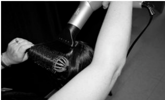
Blow-Dry Styling Techniques