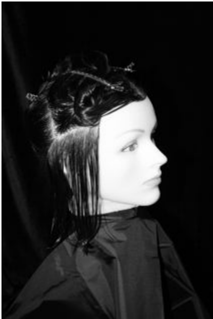
Haircutting Techniques: Four-Section Parting - Hanging Guideline Down (right side view)