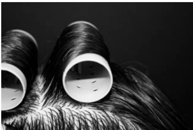
Demonstration of Techniques: Second Roller – Half Off Base (top)