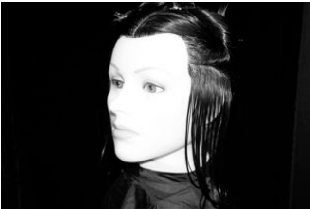
Haircutting Techniques: Four-Section Parting (left side view)