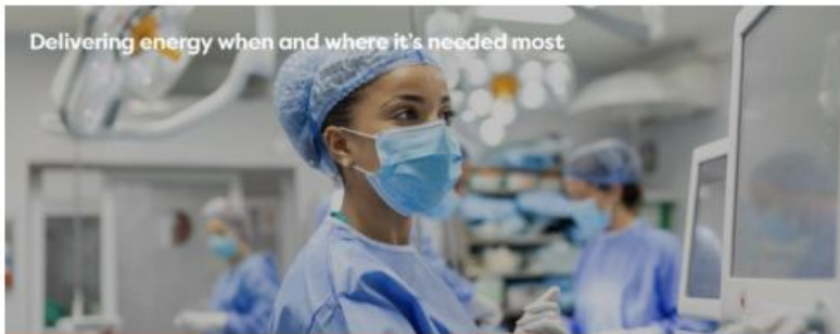
Delivering energy when and where it's needed most