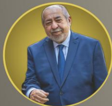
BISHOP RAYMOND RIVERA